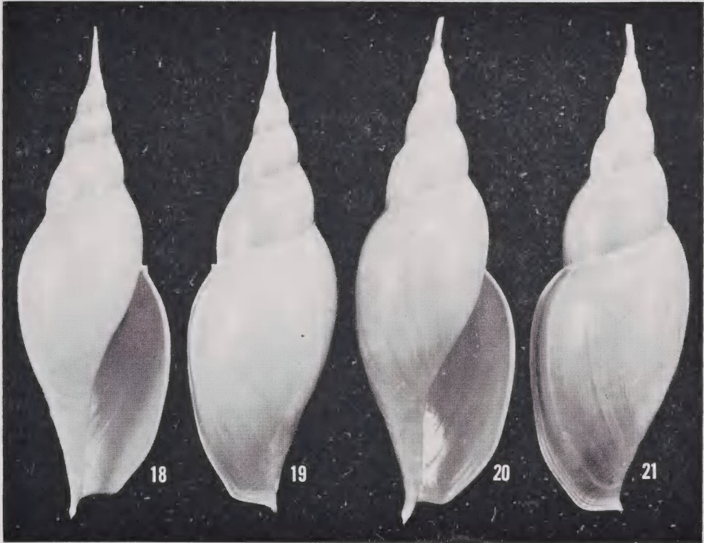
Figs. 18-21. Iredalina mirabilis Finlay, off Poor Knights Islands, 439-475m. Figs. 18, 19, ♂, 122+ x 37mm. 20, 21. ♀, 125 x 37mm.